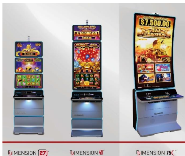
Konami – DIMENSION 27 Cabinet™ (Left), DIMENSION 49 Cabinet™ (Middle) and DIMENSION 75C™ Cabinet (Right)

Konami, the gaming machine specialist from Australia, presented the slot cabinets DIMENSION 27™ , DIMENSION 49F™ , and DIMENSION 75C™ , which are the most popular machines of their latest product line, the "DIMENSION" Series. The showcased "DIMENSION" machines contain three 27-inch monitors, a 49-inch 4K monitor, and a 75-inch 4K monitor respectively, with a vast game library, including the popular link progressive Jackpot - All Aboard. The modern and cutting-edge design of the machines can illuminate the gaming experience and attract players from afar, especially the 75C machine, which offers a jaw-dropping, mega C-curve display to provide players with a unique excitement and a different gaming experience.