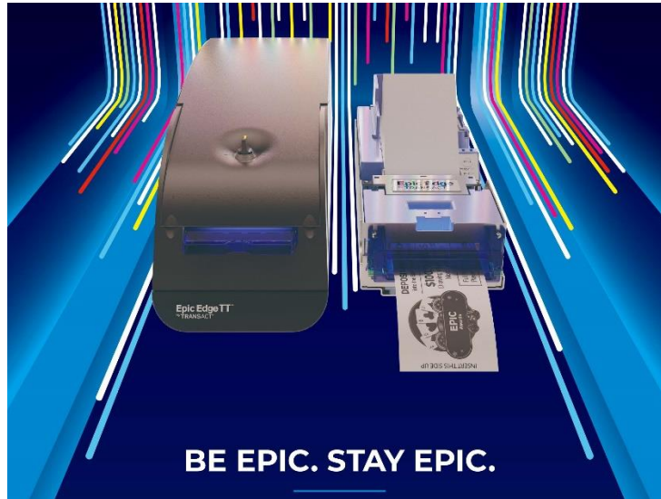
TransAct – Epic Edge® TT TITO Printer (Left) and Epic Edge® TITO Printer (Right)