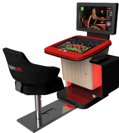
Spintec – Aura virtual stand-alone multi-game

Spintec, the Slovenia-based ETG manufacturer and designer, is well-known for its state-of-the-art gaming solutions, such as the Aura Amphitheatre gaming solution. At the MGS show, Spintec showcased the Aura virtual stand-alone multi-game , where players can enjoy popular ETG games including Roulette, Sic-bo, Craps, Black-jack and Baccarat in one playing station with unparalleled comfort, concurrent betting and seamless performance. Spintec also displayed the KARMA GEN2 Automated Sicbo and Roulette at the MGS show. With the new signage design and latest Jackpot features, they guarantee longer gaming sessions and increased revenue for casino operators. They will have to exciting release in the next Gaming Show in London!