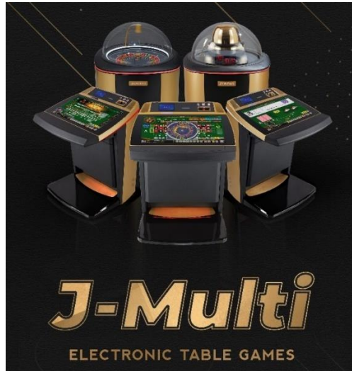
Jumbo - J-Multi Series ETG Cabinets