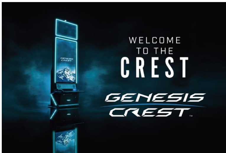
Sega Sammy – "Genesis Crest™" Cabinet

Sega Sammy Creation, a Japan-based gaming machine manufacturer, showcased their new product, the "Genesis Crest™" slot machine, at the MGS show. The "Genesis Crest™" cabinet features a 49-inch 4K touch monitor and captivating LED lighting effects. With its stylish and eye-catching design, it effortlessly attracts players' attention. Furthermore, "Genesis Crest™" offers an immersive gaming experience through its extensive game library.