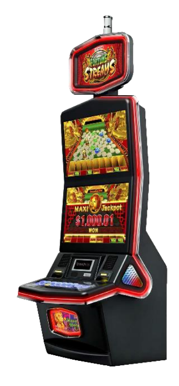
KONAMI - Concerto

Konami Australia Pty Ltd unveils its latest gaming cabinet "Concerto", which has been recently approved by The Gaming Inspection and Coordination Bureau (DICJ) in Macau. The premium series releases with this cabinet is named "Cai Lai Si Ji" and includes standalone progressive jackpot settings. This series consists of three game titles — "Wealth of Dynasty", "Winning Animals" and "Power of Riches". Konami is also bringing the anticipation of its popular Fortune Streams 4-level progressive to KP3+ with Asian-inspired art elements in a new standalone bonus called Fortune Streams Link, along with Smash Smash Festival and Money Galaxy. Fortune Streams is now approved by DICJ in Macau.