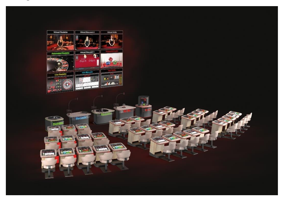
Spintec – Aura multigame playing station

Being nominated as the Best Electronic Gaming Solution in the G2E Asia Awards 2018, Spintec is presenting it's hot games Karma Automated Roulette and Sic Bo with 8 playing stations or Aura Multigame to the visitors. New Karma GEN2, successor of Karma first generation, provides the ultimate gaming experience invincible by any other related products on the market. Their research and development team focus on establishing longer gaming sessions together with the state-of-the-art design. Aura works best in amphitheatre set-ups with multiple screens and tables in front, but it can also be used in an island with one central screen or as a stand-alone station for a virtual game.