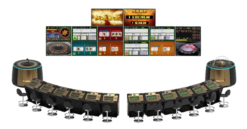
Jumbo multi-game ETG

Konami Australia Pty Ltd unveils its latest gaming cabinet "Concerto", which has been recently approved by The Gaming Inspection and Coordination Bureau (DICJ) in Macau. The premium series releases with this cabinet is named "Cai Lai Si Ji" and includes standalone progressive jackpot settings. This series consists of three game titles — "Wealth of Dynasty", "Winning Animals" and "Power of Riches". Konami is also bringing the anticipation of its popular Fortune Streams 4-level progressive to KP3+ with Asian-inspired art elements in a new standalone bonus called Fortune Streams Link, along with Smash Smash Festival and Money Galaxy. Fortune Streams is now approved by DICJ in Macau.