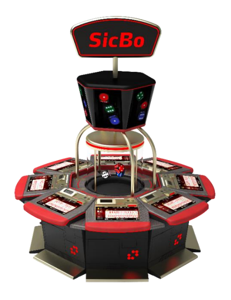
Spintec – Karma GEN2 Sic Bo