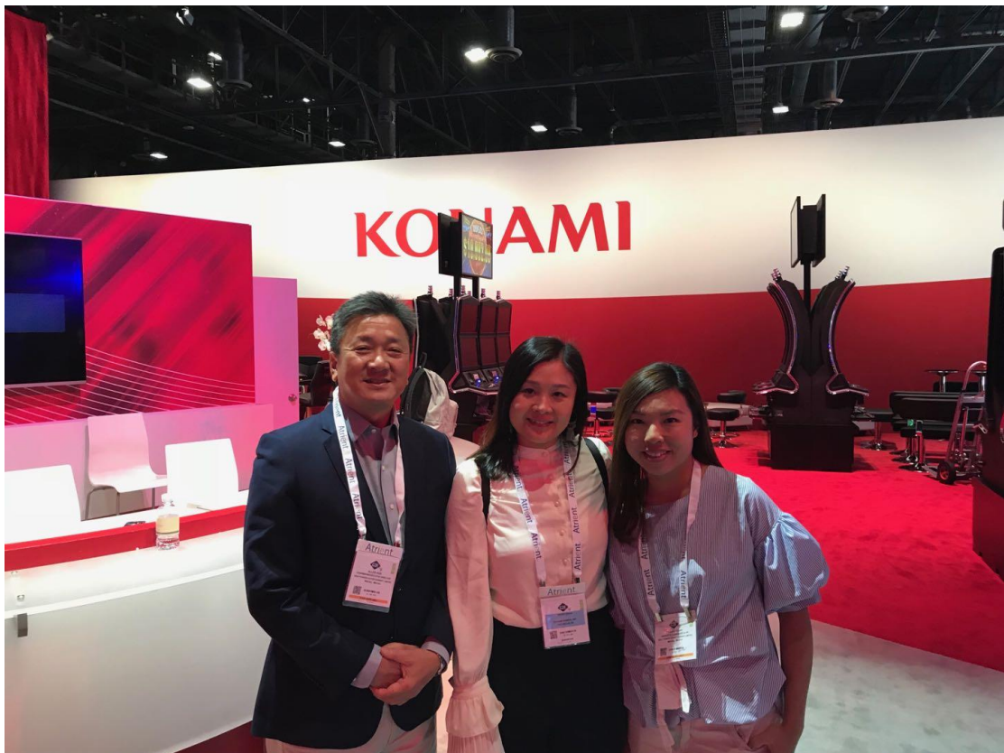
Asia Pioneer Entertainment Holdings Limited recently visited their suppliers' booths